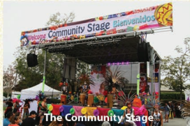
The Community Stage

Main outdoor stage. Continuous entertainment, Your logo on oversized banner