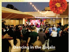
Dancing in the Zocalo