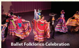
Ballet Folklorico Celebration

Continuous professional performances in the Theatre