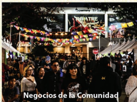
Negocios de la Comunidad