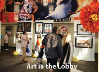
Art in the Lobby