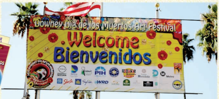
Festival "Welcome Banner"