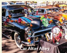
Car Altar Alley