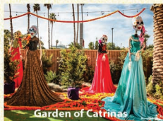
Garden of Catrinas

10' tall ladies, dressed in their finest!