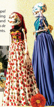
Garden of Catrinas